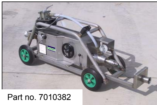
Part no. 7010382

Application : Cleaning of fully or partially blocked pipelines in various industries Removing : Cement, plastics, bauxite, coke and much more from steel, plastic and concrete pipes, etc.